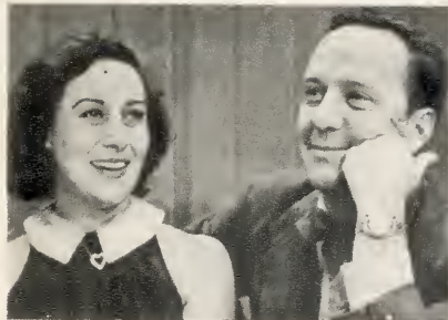
And with John Daly on What's My Line ?

Most any day you turn on your TV set, you're apt to run into Arlene Francis. As president and cheerleader of the tri-network Arlene Francis cartel, she glitters handsomely Sundays on What's My Line , (CBS) cavorts wholesomely once a week with service men on Talent Patrol (ABC) and mornings, Monday through Friday, is a kind of folksy little homebody for the Home (NBC) show.